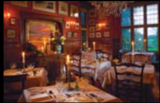
MILLER'S AT GLENCOT HOUSE RIVERVIEW RESTAURANT

MILLER'S AT GLENCOT HOUSE GLENCOT LANE, WOOKEY HOLE, WELLS, SOMERSET, BA5 1BH