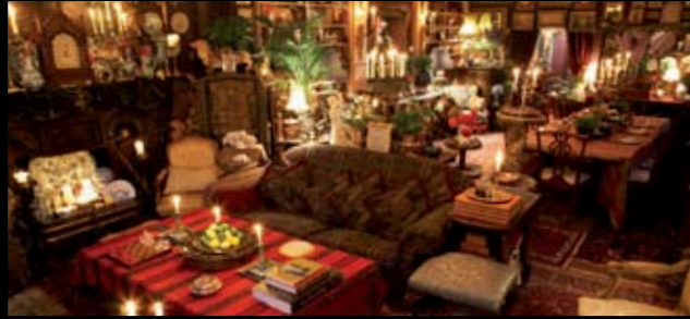
MILLER'S RESIDENCE OUR LONDON HOTEL WWW.MILLERSHOTEL.COM